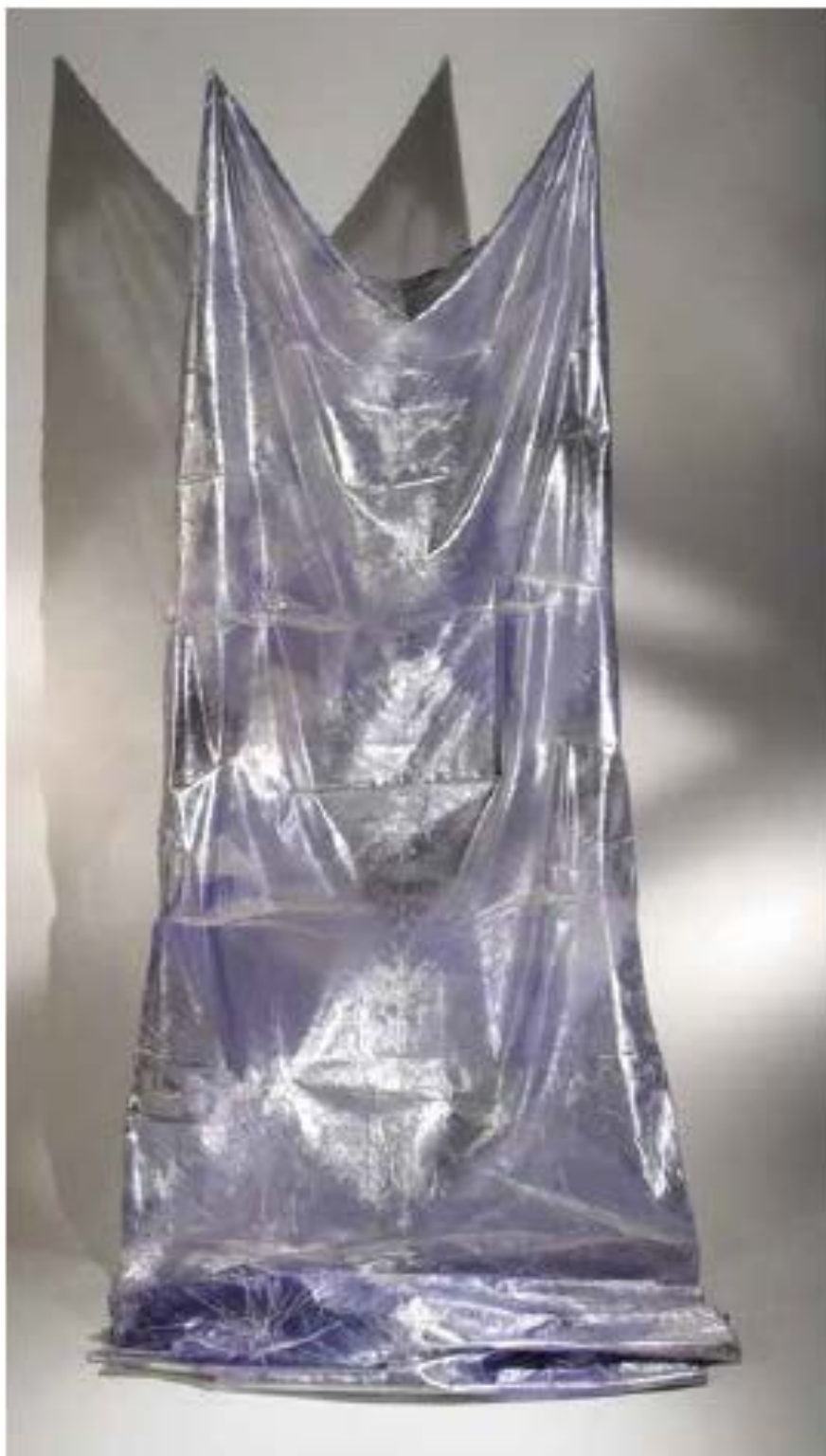
Sky-Clouds-Wind . Disperse dye printed on voided metallic polyester organza. 180" × 65" suspended.