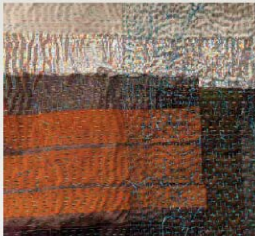
Kinbinō Nirvana . Metallic threads stitched on layered polyester organza. 36" × 45". | Detail